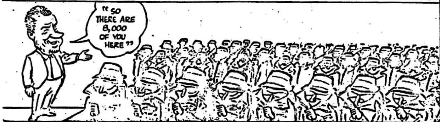
Daily World (Communist) 4-26-69

NIXON, DURING VISIT TO SUPER-SECRET CIA HEADQUARTERS NEAR LANGLEY, VA., ACCIDENTLY REVEALED THE "WORK" FORCE THERE: